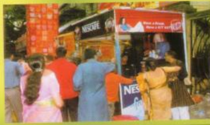
Stall Big 12' x 10'